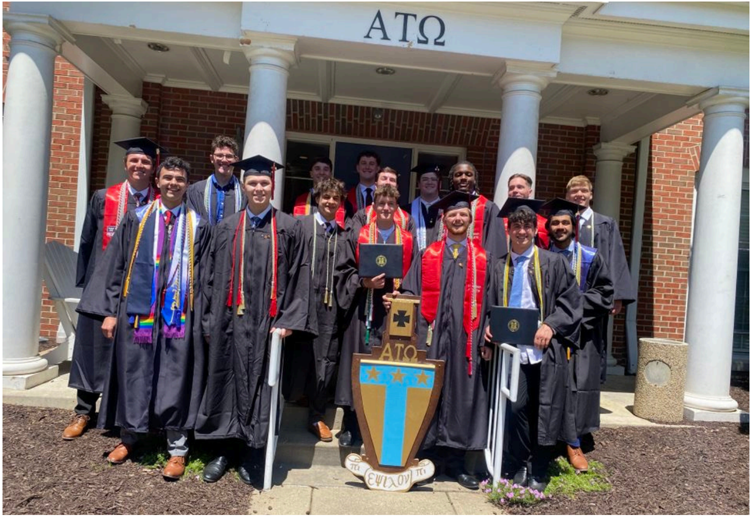
Graduated Seniors / Class of 2025