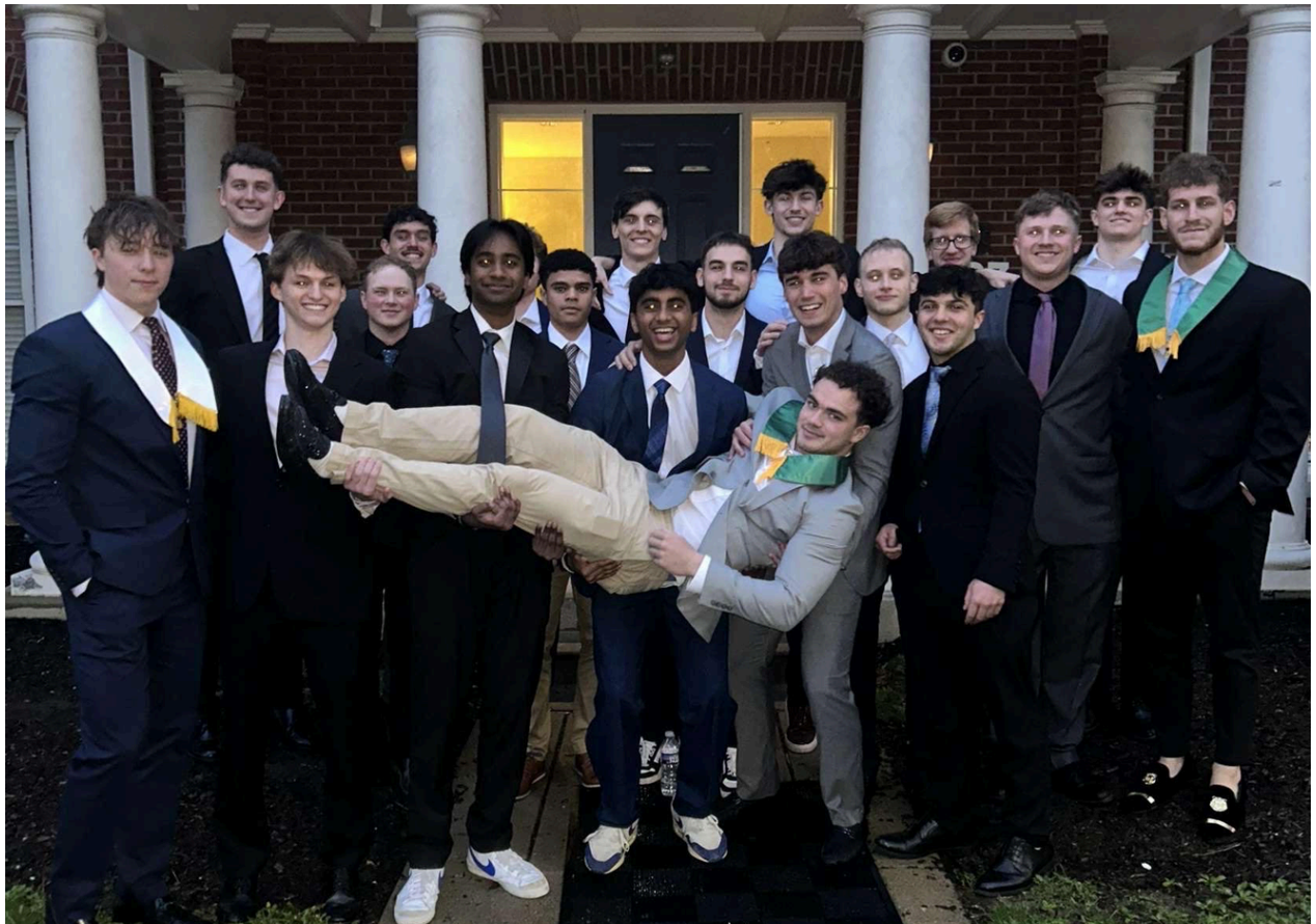
Spring Class of 2025