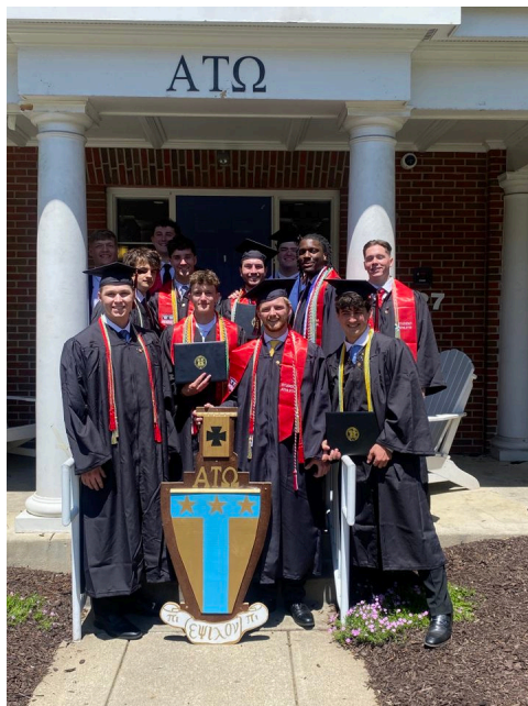
Graduated Seniors / Class of 2025