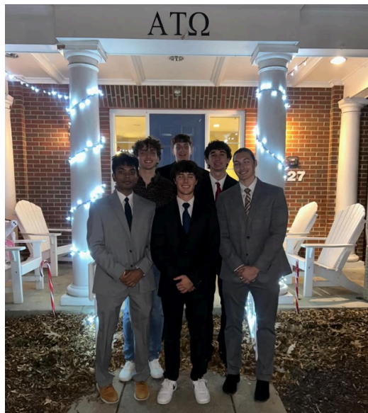
Fall Class of 2024